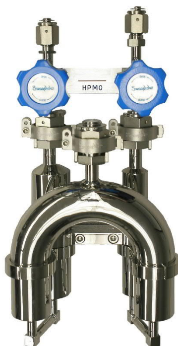
The Hiperloop TMIn bubbler

Nouryon High Purity Metalorganics (HPMO) has developed a High Performance Loop Bubbler, called the Hiperloop that consistently delivers stable Trimethyl indium (TMIn) flows from solid TMIn with greater than 90% source consumption. This performance has been demonstrated for flow rates of 300 sccm to 1000 sccm. As such, the Hiperloop offers better utilization of the TMIn source material and higher flow rates using a single bubbler design.